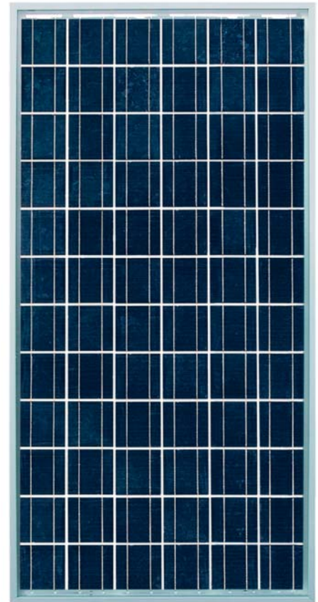
SCHOTT POLY™ 165/170/175/180