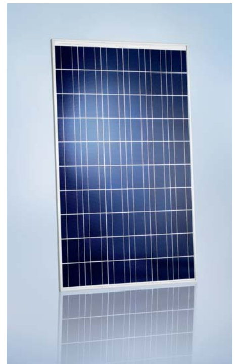
SCHOTT POLY™ 217/220/225/230